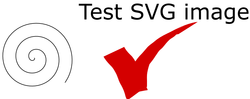
Figure 1: Test SVG image

We recommend using Inkscape for creation and edition of vector graphics. The graphics created in MS Word Draw and some other vector editors can be copy-pasted to Inkscape and saved as SVG images.